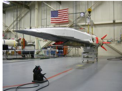
U.S. Air Force X-51 Scramjet Engine Demonstrator