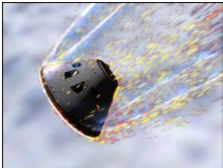
NASA Orion Re-entry Vehicle

A Hypersonic Vehicle is a vehicle that travels at least 4 times faster than the speed-of-sound, or greater than Mach 4. A hypersonic vehicle can be an airplane, missile, or spacecraft. Some hypersonic vehicles have a special type of jet engine called a Supersonic Combustion Ramjet or scramjet to fly through the atmosphere. Sometimes, a hypersonic plane uses a rocket engine. A Re-entry Vehicle is another type of Hypersonic Vehicle. A Re-entry Vehicle is a spacecraft that travels through space and re-enters the atmosphere of a planet, and most of the time, does not have an engine.