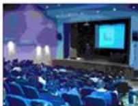
Instructor, Aerospace Short Courses