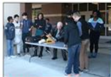
STEM Education, Aerospace Engineering