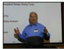
University, Aerospace Engineering Teacher