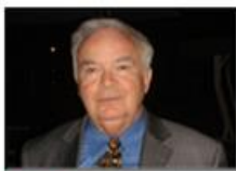
Industry, Aerospace Program Manager