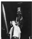
Government, Aerospace Engineer