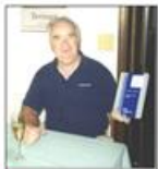
Author, Aerospace Textbooks et al