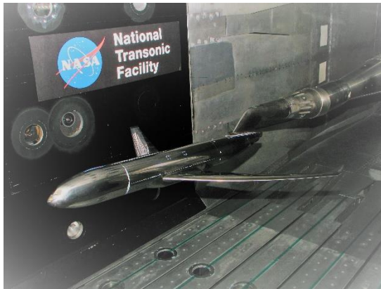
NASA Common Research Model (CRM)

NOTE: DPW-7 test cases DO NOT include the horizontal tail.