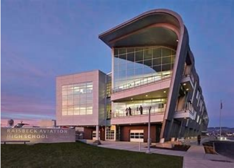
Raisbeck Aviation High School Seattle, WA