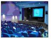
Instructor, Aerospace Short Courses