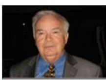
Industry, Aerospace Program Manager