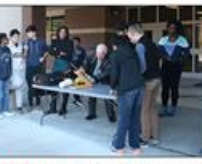
STEM Education, Aerospace Engineering