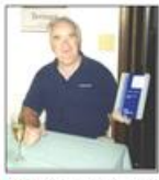
Author, Aerospace Textbooks et al