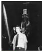
Government, Aerospace Engineer