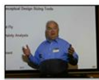
University, Aerospace Engineering Teacher