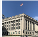
The U.S. Chamber of Commerce Building is located at 1615 H Street NW in Washington, D.C.

AIAA's policy breakfast program is designed to connect our members with government stakeholders and other thought leaders. It covers topical issues of relevance to the aerospace community and offers a great opportunity to network with key representatives across government, industry, and academia. The events take place in the Washington, D.C., area, have limited access, and are considered "off the record."